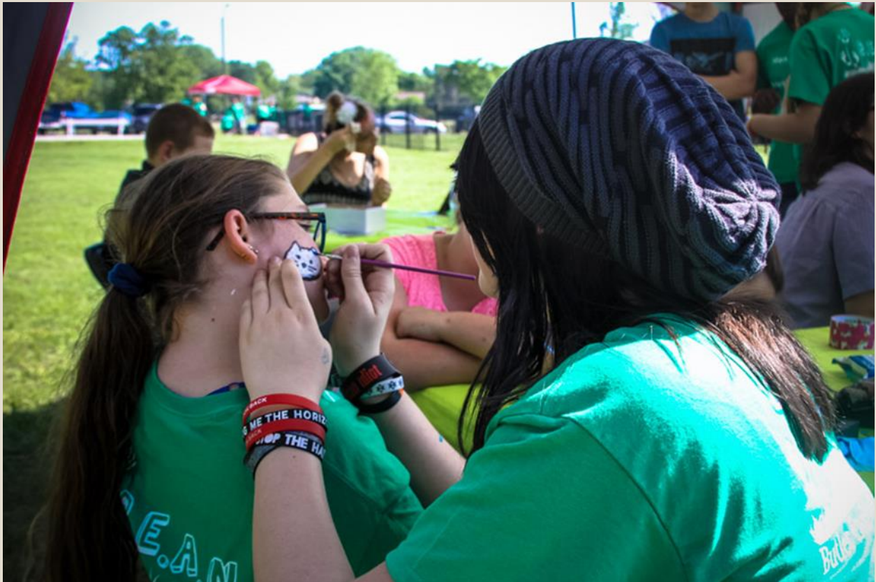
SCMH sponsors Mental Health Awareness Day, May 10 th , 2018