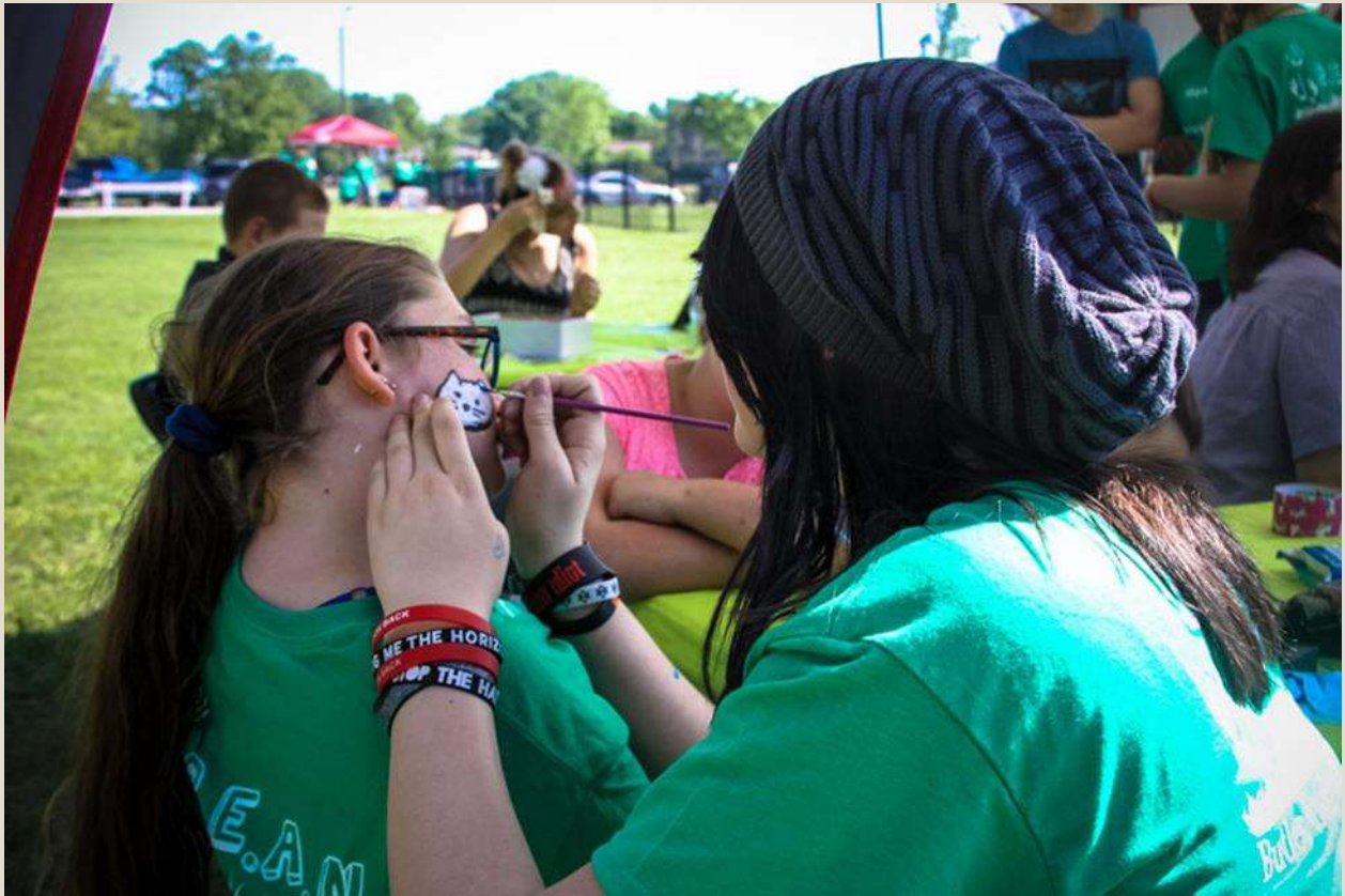
SCMH sponsors Mental Health Awareness Day, May 10 th , 2018